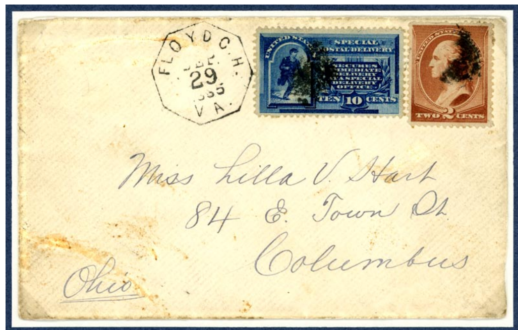
First Day of Use, two days before stamp issue and beginning of service Oct. 1, 1885